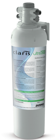
Head sold separately.

Claris Ultra 1500-XL Filter Cartridge: EV4339-83