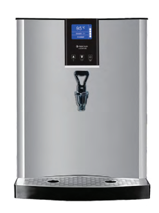
Pentair Everpure Wall-mounted Hot Water Dispenser BHW1-30